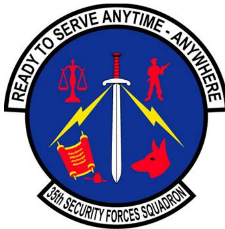
35 th Security Forces Squadron

On a blue disc edged with a narrow black border a sword with blade to base in pale (pale and guard white, hilt and pommel red, all details black) emitting from its hilt two yellow lightning bolts chevron wise to base between in the upper portion of the disc a silhouetted red Scales of Justice in dexter and a silhouetted red stylized sentry in sinister and in the lower portion of the disc a red scroll garnished yellow above a red ink bottle and pen in dexter base and a red silhouetted head of a dog in profile, coupé at the neck and eyed black in sinister base. The Sword with Lightning Bolts is indicative of the squadron Motto, "Ready To Serve Anytime Anywhere",